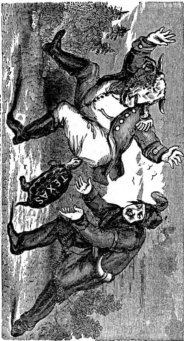
JOHN BULL OPPOSED TO ANNEXATION.